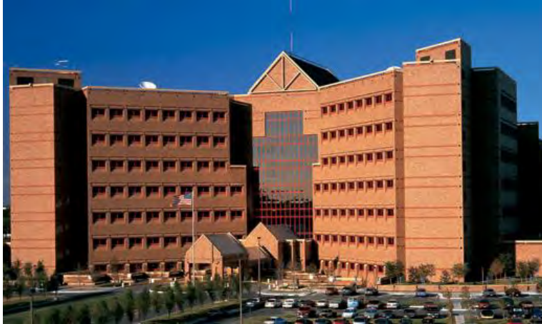
Brooke Army Medical Center