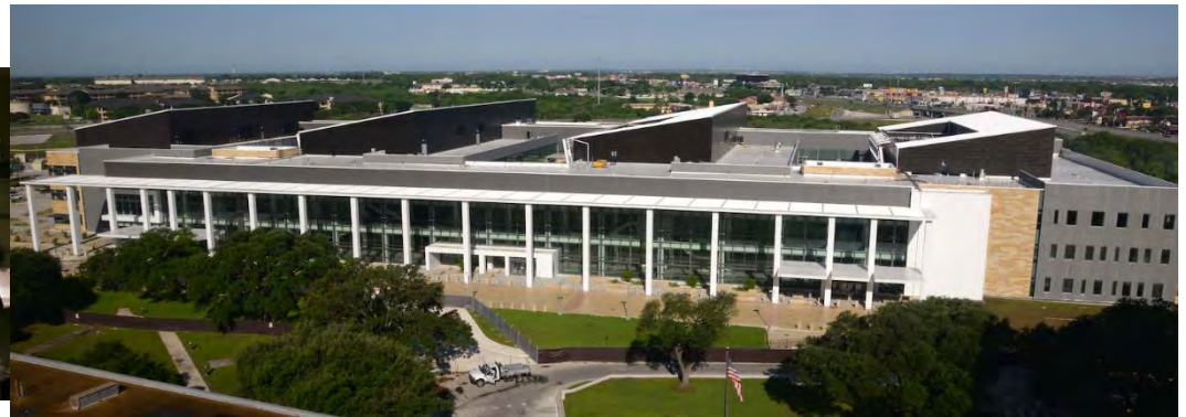
Wilford Hall Ambulatory Surgical Center