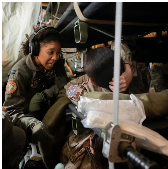
U.S. Air Force Reserve Aeromedical technicians and their Peruvian counterparts perform a casualty evacuation training scenario in Callao, Peru, during exercise Resolute Sentinel 23.