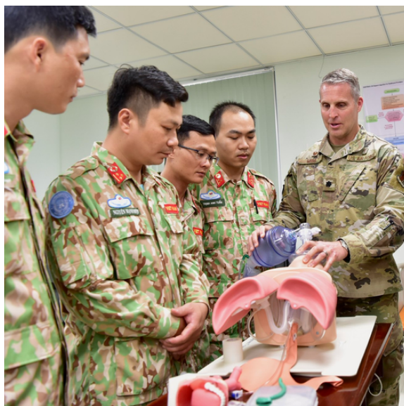
Oregon Air National Guardsman demonstrates airway management skills during an International Trauma Life Support course in Ho Chi Minh City, Vietnam.