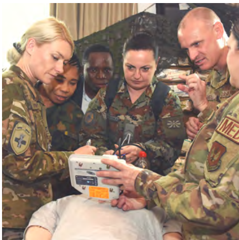
Delegates from the United States, Nigeria, North Macedonia, and Slovenia share intubation techniques during the U.S. Air Forces in Europe - Air Forces Africa's European-African Military Nursing Exchange conference.