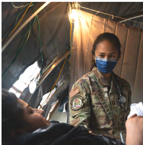
Medical Pods at the temporary Joint Mobility Processing Center at Ramstein Air Base, Germany are the first stop for medical care for newly arrived evacuees from Afghanistan during Operation Allies Welcome.