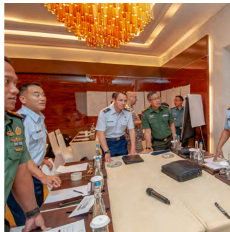
Hawaii Air National Guard and Indonesian Armed Forces medical experts engage in debate on how to best approach different pandemic response scenarios during a Pandemic Subject Matter Expert Exchange in Jakarta, Indonesia.